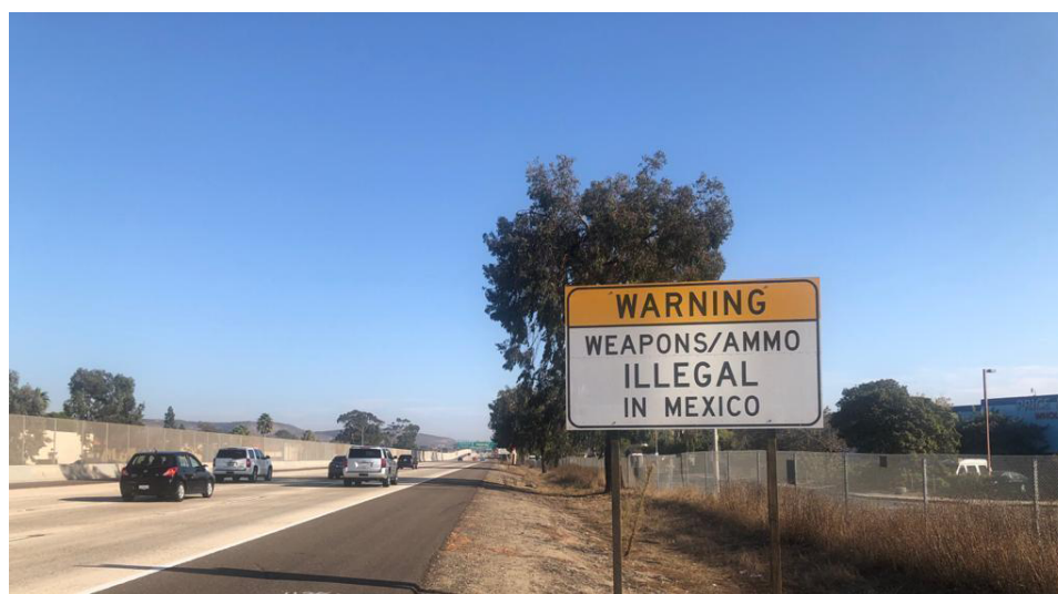
Figure 2. Signage on the I-5 in San Ysidro, California