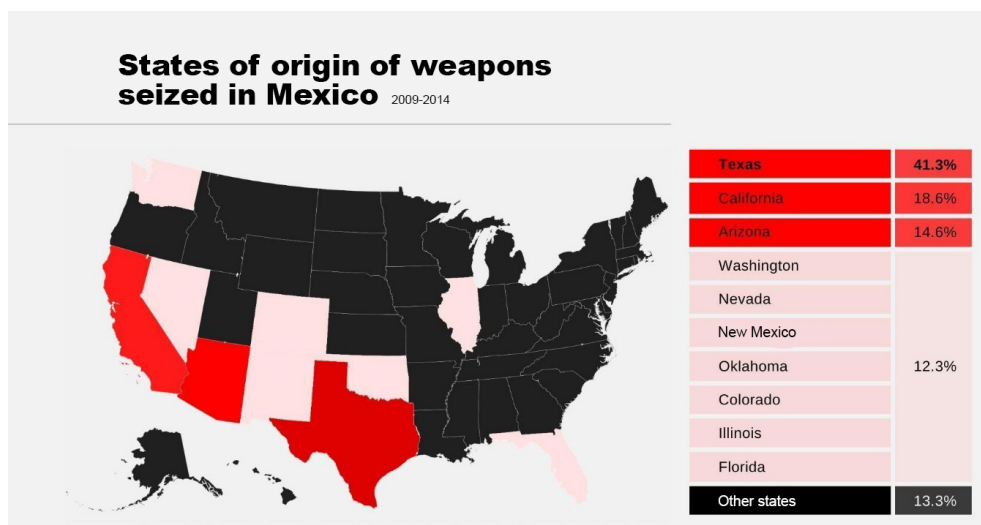
Figure 3. Origin of trafficked arms in Mexico

Created by Melissa Urquidez