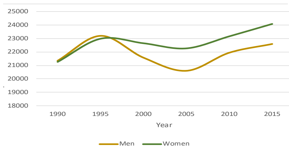
Figure 2. Tres Valles demographic behavior, by gender, 1990-2015

Source: created by the author with data from XI Censo General de Población y Vivienda 1990 (Inegi, 1990); XII Censo General de Población y Vivienda 2000 (Inegi, 2000); Censo de Población y Vivienda 2010 (Inegi, 2010); Encuesta Intercensal 2015 (Inegi, 2015).