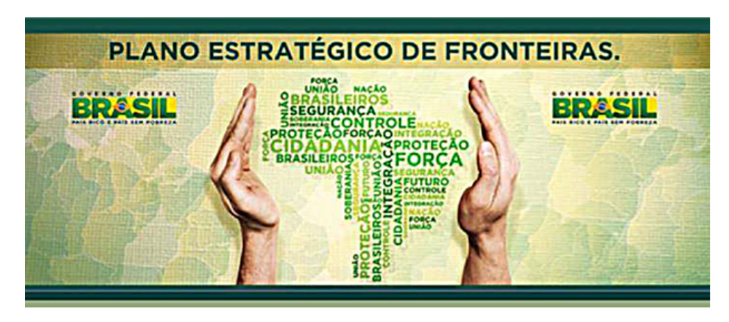
Figure 4. A "Detached" Brazil

The idea of the border as the periphery line that guarantees both unity within and difference without, thus making the consideration of the numerous transborder relations a matter secondary importance, is a constant in the area of planning in the case of several countries. An example that illustrates this concept is Figure 4, in which the "Plano Estratégico de Fronteiras" is promoted with a map of Brazil that paraphrases Daus, "detached from the rest of South America." This idea is simple and puts a question to anyone who has been socialized with the cartographic evidence of a national territory equated with a figure introduced in the form of a polygon, filled with the single color red and placed on a large "empty" surface that covers the entirety of the page used for the representation. We find this same idea on the cover of many academic works focusing on interstate borders, such as in Figure 5. Although the authors of this book are not unaware of the multiscale tensions to which the borders of the Brazilian state are subjected, they opt for a "detached" image when choosing an image for its cover.