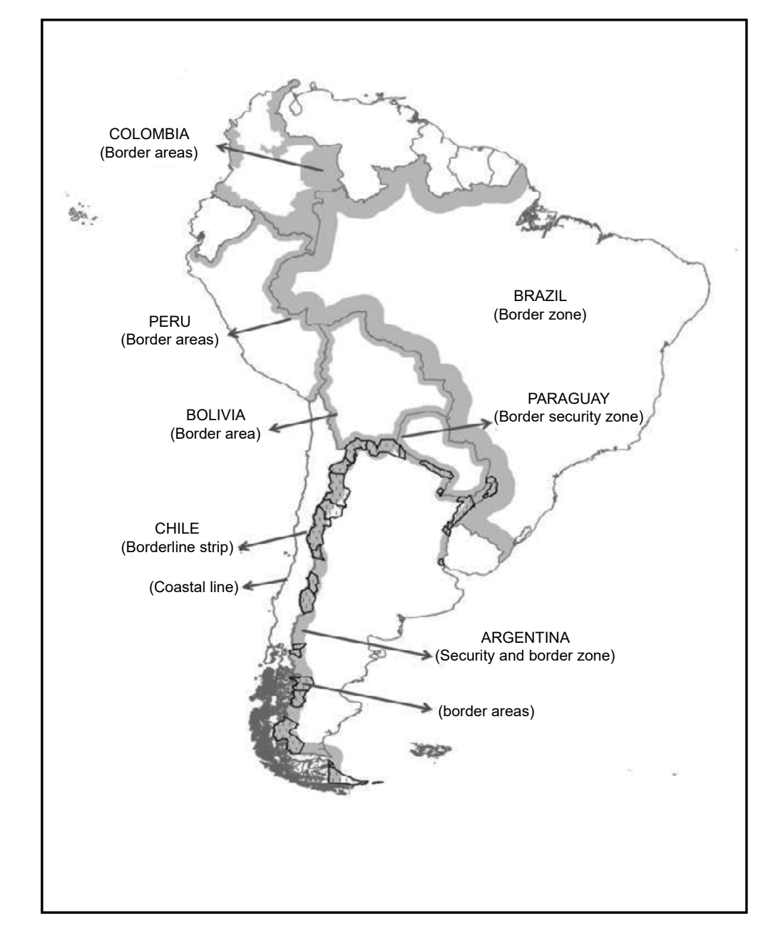
Figure 2. Denomination of the border zones in South America, by country