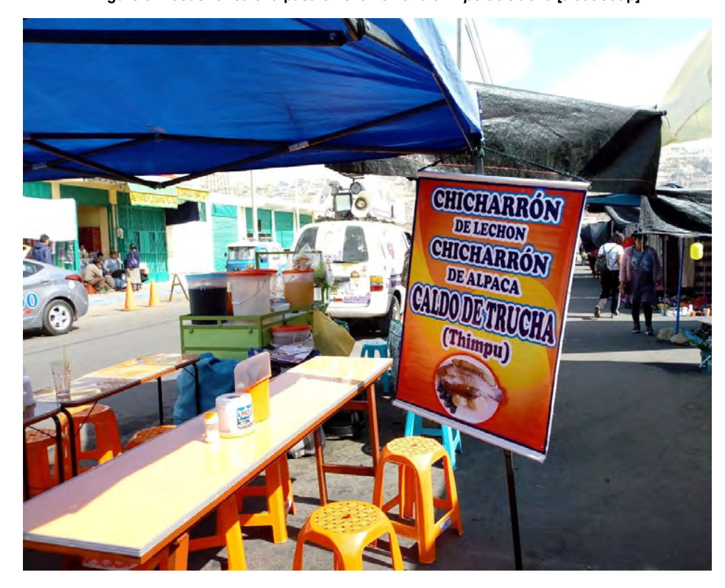
Figure 5: Foods for sale: alpaca chicharrón and thimpo de trucha [trout soup]

Thus, the products sold by food vendors lead us to rethink the Peru-Chile border corridor. If we limit the border corridor to the Tacna-Arica relationship, how can we explain the cultural presence of the Peruvian highlands typical of the Peru-Bolivia border corridor in a commercial activity recognized in the literature as specific to the Peru-Chile border? The same question is raised when analyzing the characteristics of food merchants. Selling second-hand clothing and footwear is not merely moving merchandise but also involves dynamics and territorial anchors in each of its various processes: purchasing clothes in Iquique or Arica (Chile), organizing the clothes at the Arica International Terminal (Chile), smuggling the clothes through the border checkpoints of Peru and Chile, moving the clothes inside Tacna (Peru) and selling these products at informal clothing and footwear informal, in addition to the various economic activities surrounding the aforementioned informal markets.