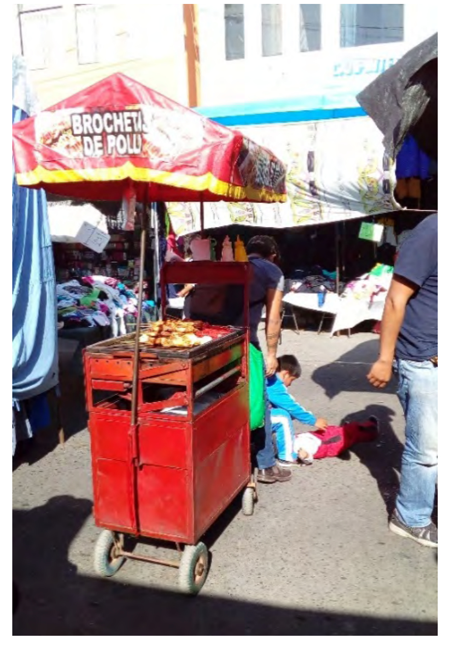
Figure 9: Food cart

In turn, culinary activities accompany the experience of informal border trade because the relationship between merchants and clients is not limited to a trade relationship but instead constructs a public sphere of relationships including food experiences shared both among merchants themselves and with the clients.