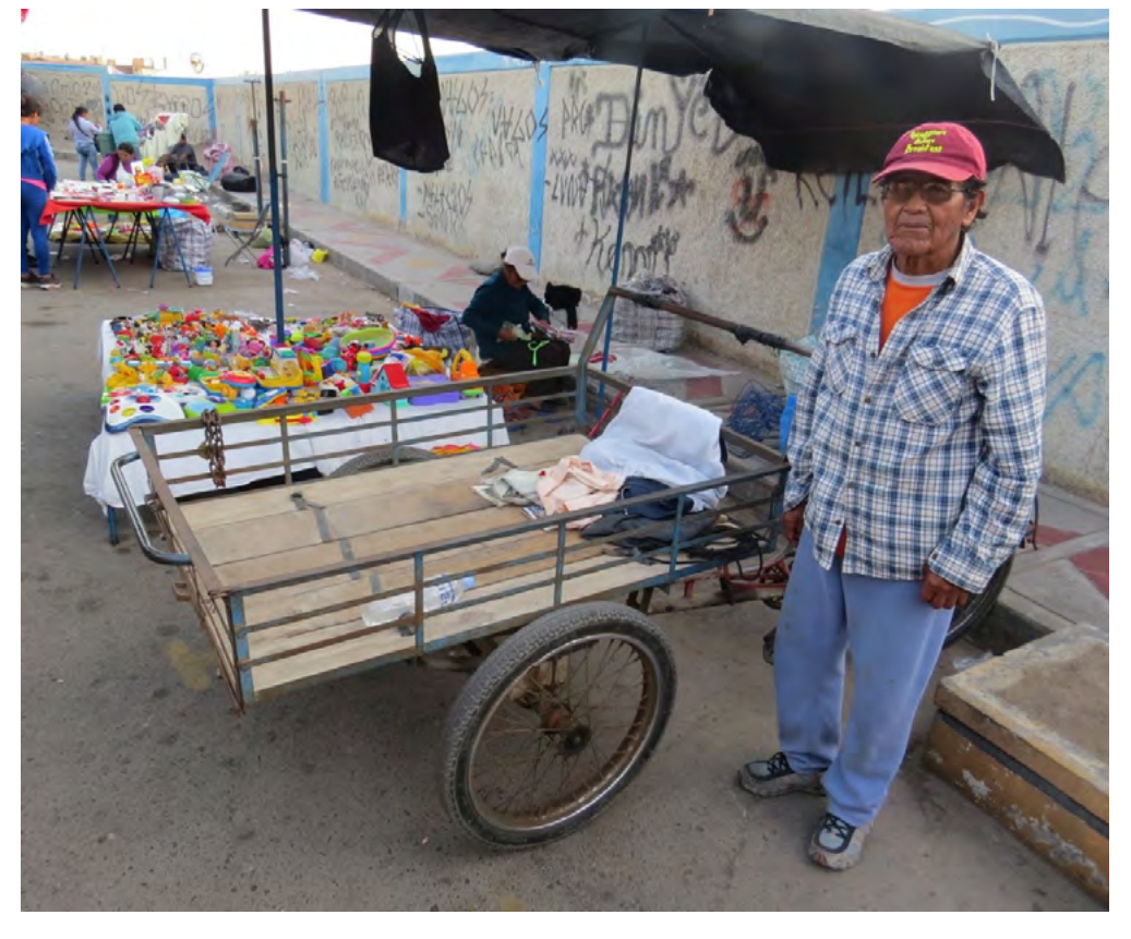
Figure 11: Senior with a cart

Last, as mentioned above, the main taxi and motorcycle taxi stands are located around the informal markets, whereas most public transportation users come from districts near Tacna such as Ciudad Nueva, Gregorio Albarracín or Alto de la Alianza. Again, the analysis of the phenomenon of mobility around clothing and footwear informal markets contradicts the so-called Tacna-Arica isomorphism of the Peru-Chile border corridor by highlighting the diverse origins of informal market users, beyond the city of Tacna.