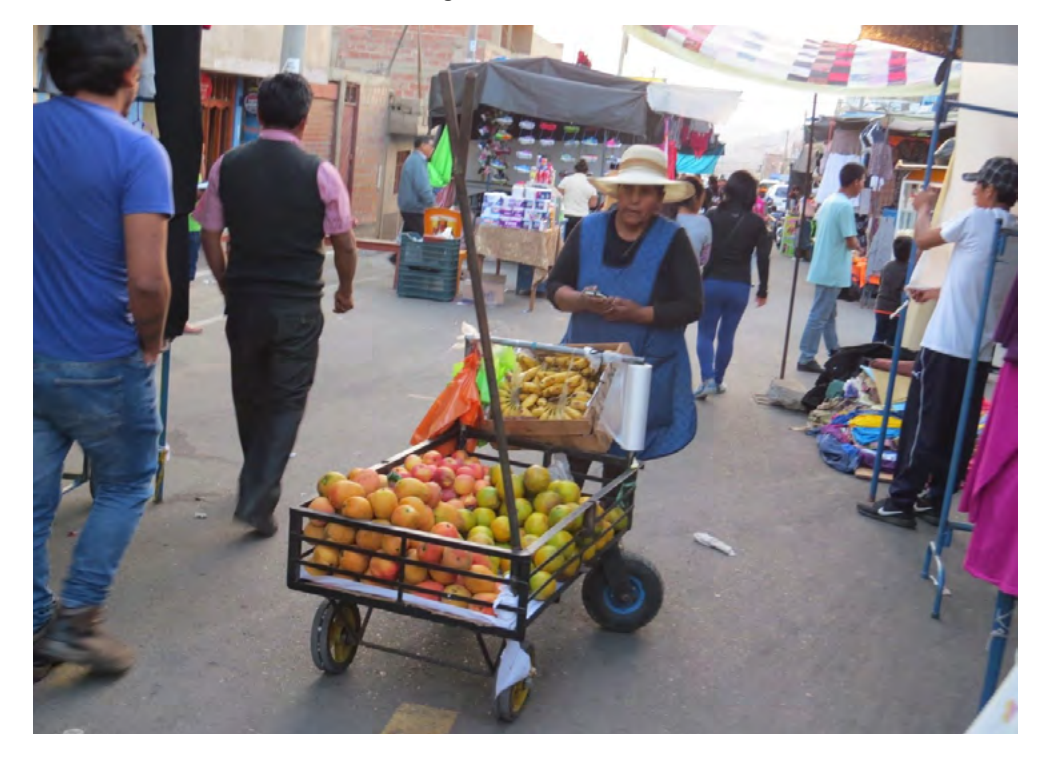
Figure 3: Fruit seller

After offering breakfast from the early hours of the morning to 10 or 11 am, to both merchants and users and clients of informal clothing markets, brunch or mid-morning foods are sold, including gelatins, ice creams, sweets and quail eggs, among others. As the merchant leaders mention, the mid-morning meal distribution hours serve, in turn, for charging for the food offered earlier in the day: breakfast