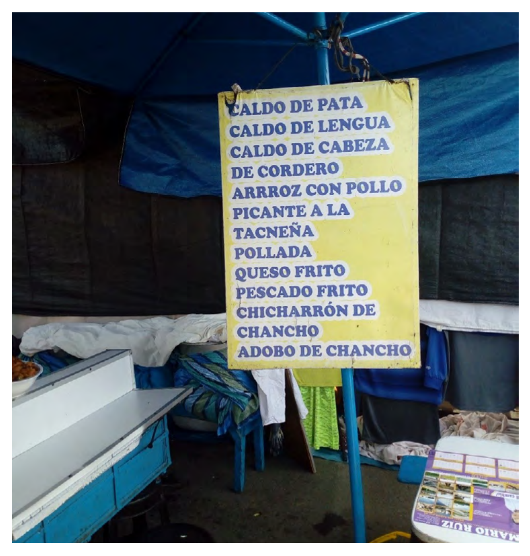
Figure 4: Foods for sale

In the early hours of the afternoon, immediately after noon, lunch sales begin, which may range from chakepa [toasted and coarsely ground barley] soup, chairito [chairo], thimpo de trucha [trout soup], mazamorra de calabaza [pumpkin pudding], fried cheese and alpaca chicharrón. These foods are offered to both stallholders and informal market clients, who can purchase several products, mainly from the South American highlands (Figure 3, Figure 4 and Figure 5).