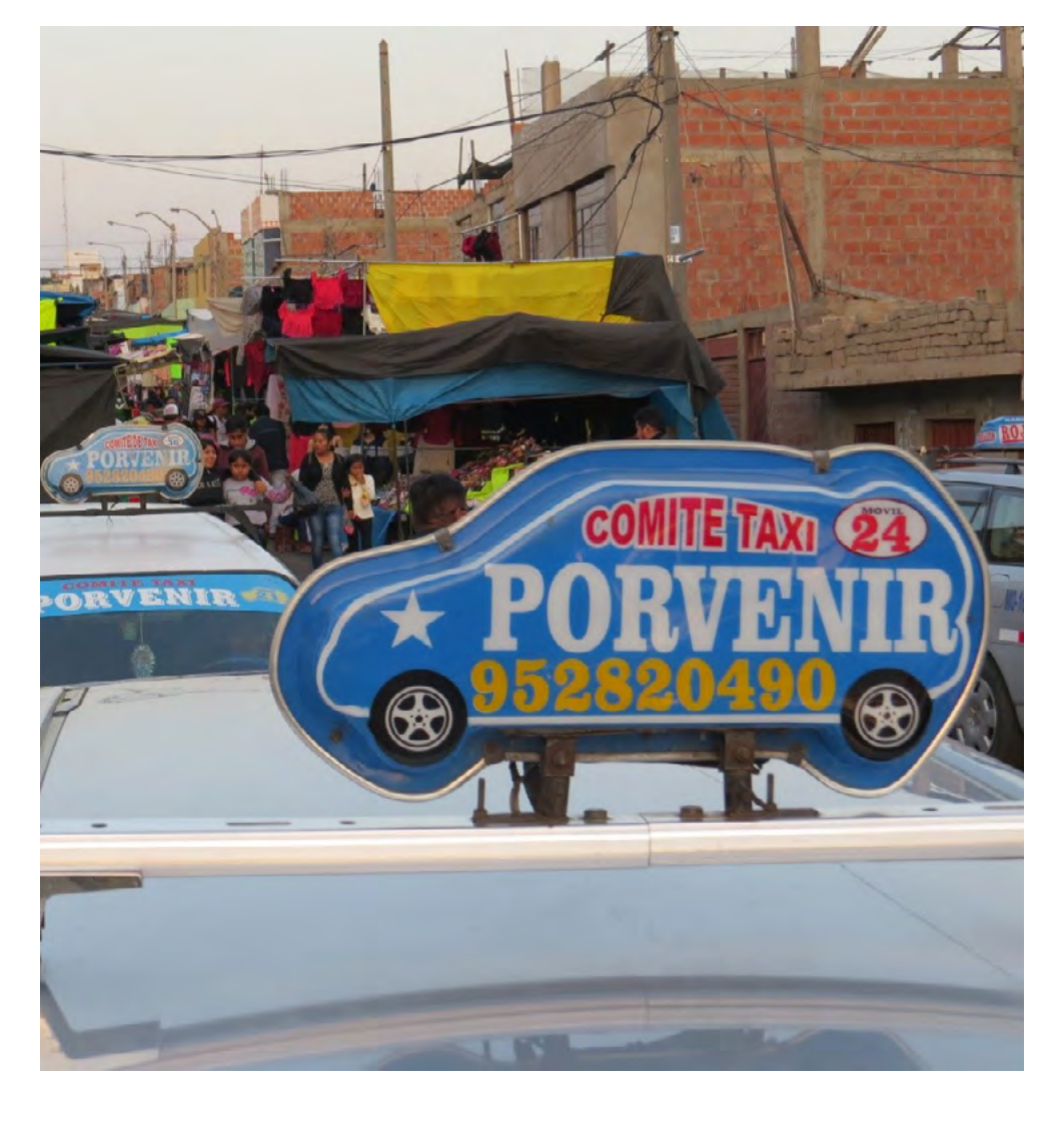
Figure 10: Taxi stand

The merchandise is moved, both inside the informal market and around the city, early in the morning (4 am), returning home late in the afternoon (5 or 6 pm). This activity has a specific profile: adult males and the elderly. In contrast to food sales, predominantly female, transportation services rely predominantly on adult males who have access to some capital to support the mobility business. However, the profile of those who transport goods in carts is the elderly male population. Although we cannot address the feminization of survival, we can emphasize that the dynamics of economic survival against capitalism are underpinned by the most indigent and disadvantaged population.