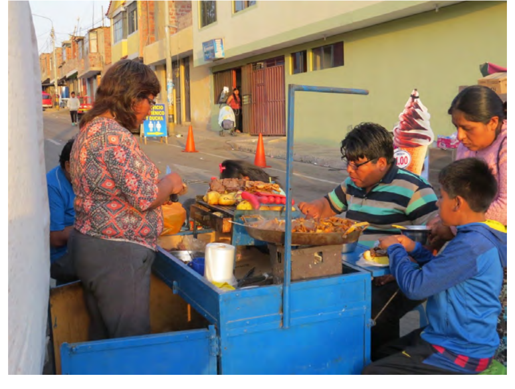
Figure 7: Female food vendor

The concept of feminization of survival (Sassen, 2003) as an analytical key is important in a context in which government revenue is collected from the income of women involved in informal economy dynamics because women's informal work enables a development circuit from which local governments benefit (through taxes paid to the municipality). This informal work includes the sale and transport of clothing as well as the commercial experience around the sale of food as one of the main businesses near the informal markets.