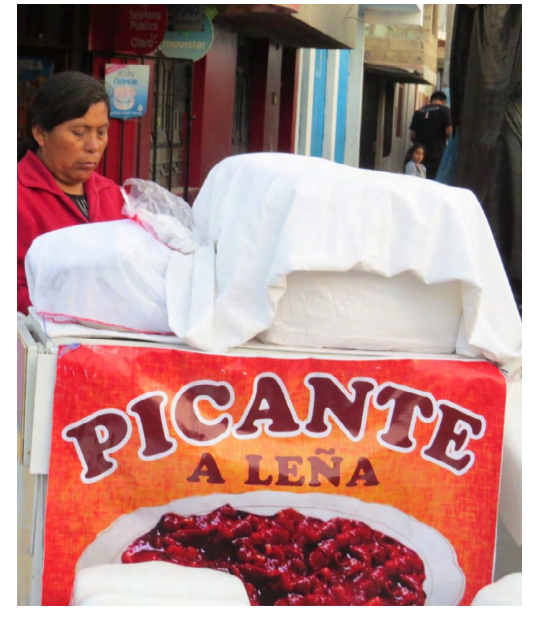
Figure 6: Seller of picante a la leña [spicy dried lamb or llama stew]

The feminization of informal practices not only encompasses most merchants of second-hand clothing and footwear but also produces economic and survival dynamics (Sassen, 2003) in the work circuits associated with the sale of clothing and footwear. Thus, women are not only the primary used clothing and footwear vendors or intermediaries between comisionistas [commission agents] and paseras [border crossers] (Dilla & Álvarez, 2018; Guizardi et al., 2014) but also the protagonists of food shops near the informal markets (Figure 6 and Figure 7).