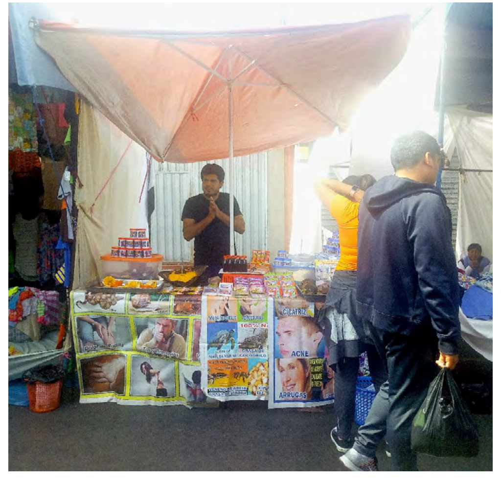
Figure 13: Personal care services

Although those who provide other services have a more heterogeneous profile than do food vendors and public transportation providers, they are predominantly young workers, who reinvent forms of economic survival thanks to the possibilities offered by informal clothing and footwear markets.