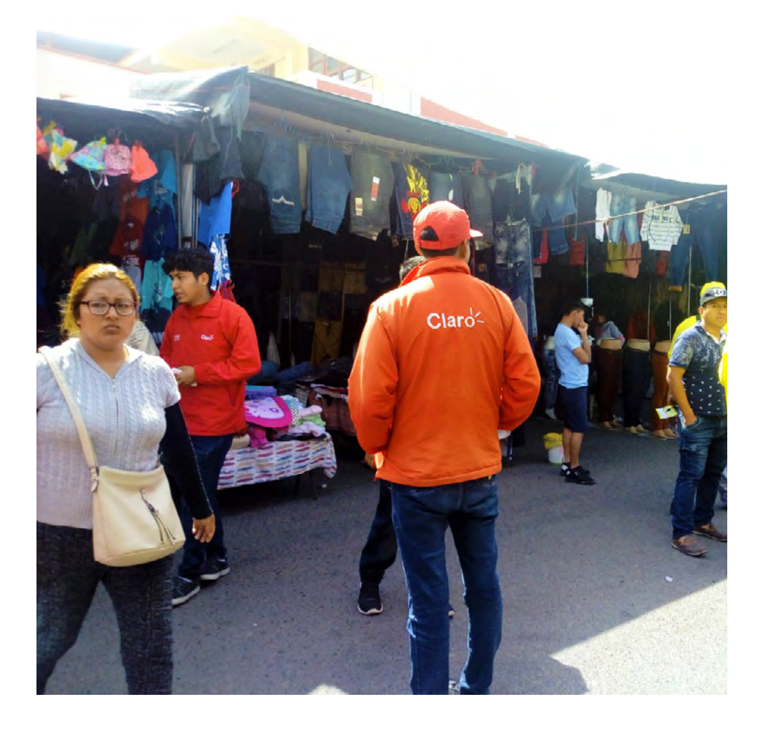
Figure 12: Cell phone service provider

Other services predominantly involves informal businesses, such as renting spaces in houses near the informal market and shower and bathroom services, in addition to alternative healthcare services, ranging from massages and natural skin care products to alternative treatments for discomforts or diseases. Conversely, formal services such as cell phone and microfinance companies take advantage of the informal economy in two broad senses: first, by harnessing the possibilities offered by the informal market in terms of access to and variety of buyers and, second, by hiring young people, predominantly contractors, who must reach specific sales goals for their monthly salaries (Figure 13).