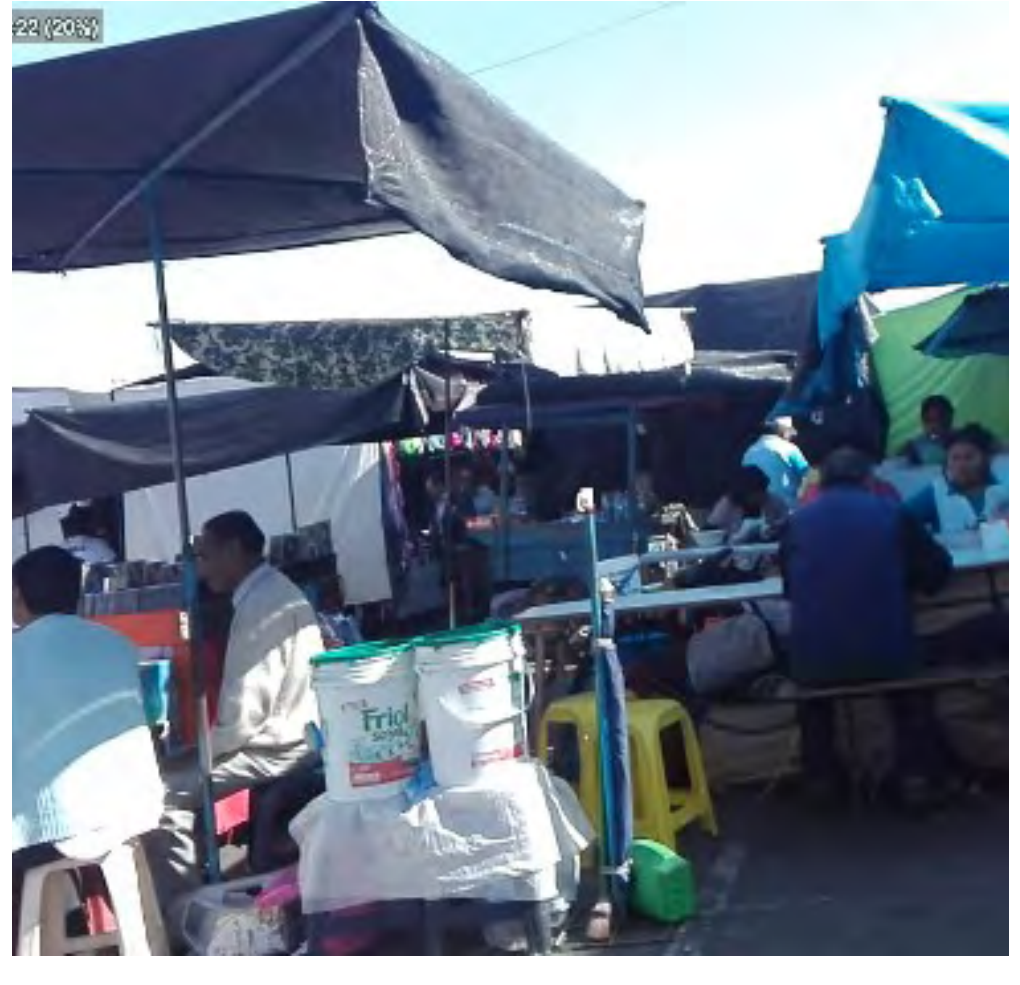
Figure 8: Food stands

Conversely, food vendors who choose to offer their products inside the informal market find various ways of moving between the busiest areas (Figure 9).